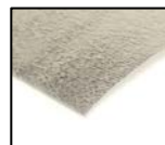
2mm or 3mm Silver